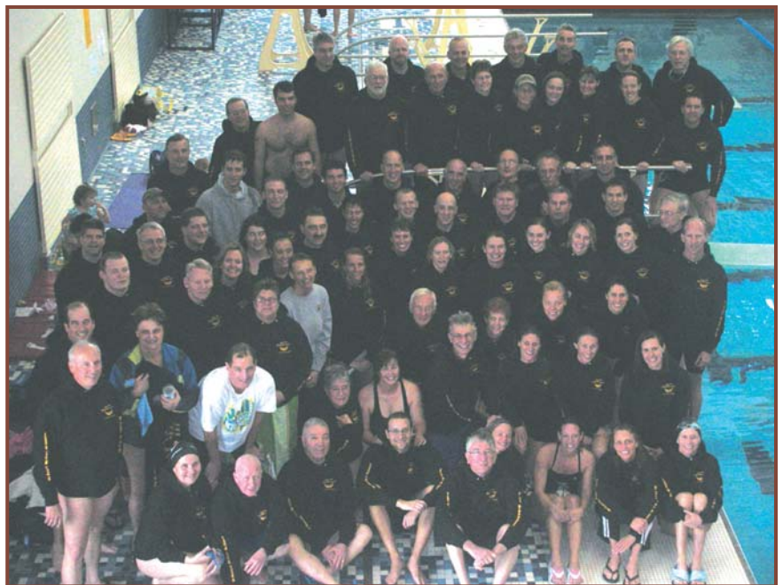
The NASTIs won the overall team points at the GRIN State Championships held in Avon.

Complete results from the 2007 Huntington mile and 5K open water swims are posted at http://www.huntingtonmile.org/2006_Results.html